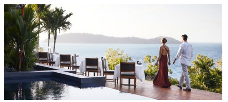
Long Pavilion Dinner