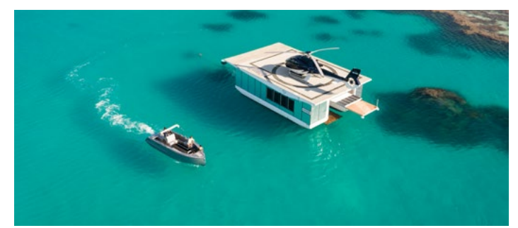
Journey to the Heart tour

Note: minimum night stay requirements apply to all packages. For more packages and information, visit www.qualia.com.au/packages