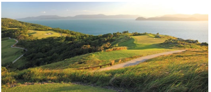
Hamilton Island Golf Club, Dent Island