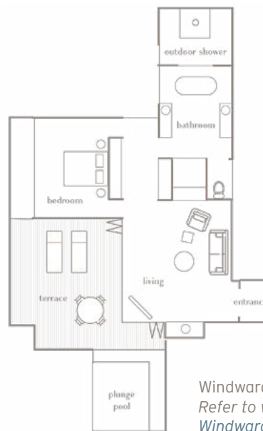
Windward pavilion Type A Refer to website for Windward Pavilion Type B

Note: qualia caters for guests 16 years and over