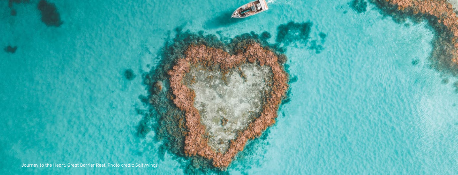
Journey to the Heart, Great Barrier Reef.