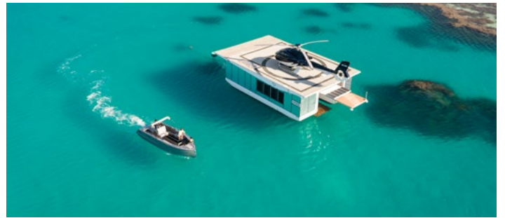
Journey to the Heart tour

Note: minimum night stay requirements apply to all packages. For more packages and information, visit www.qualia.com.au/packages