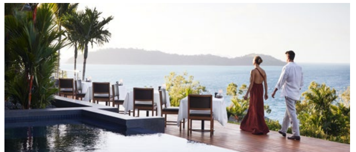
Long Pavilion Dinner