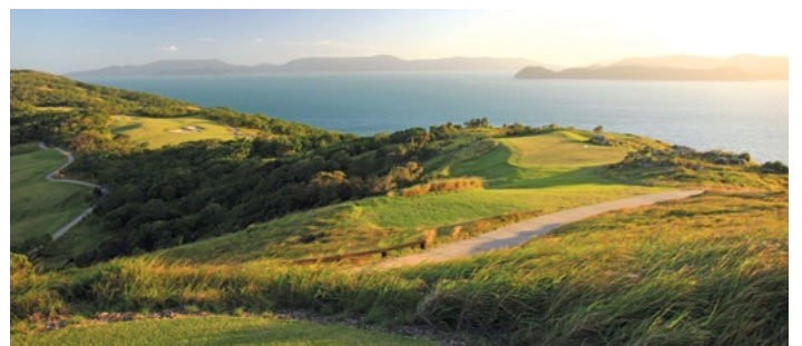
Hamilton Island Golf Club, Dent Island