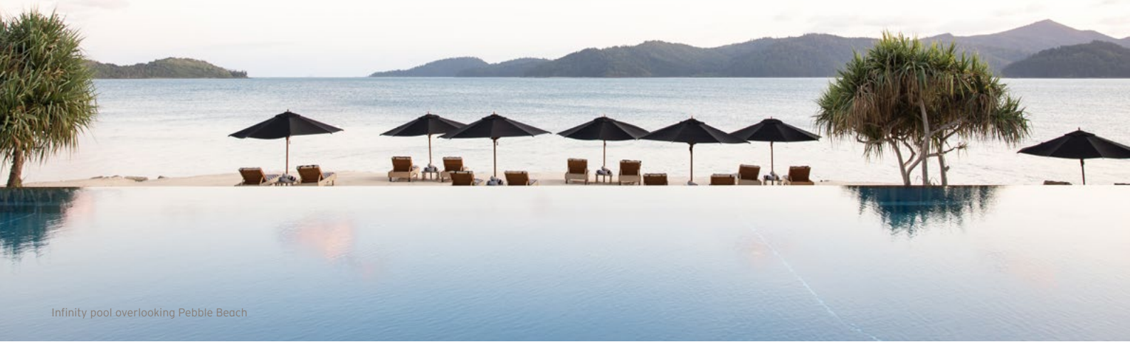
Infinity pool overlooking Pebble Beach