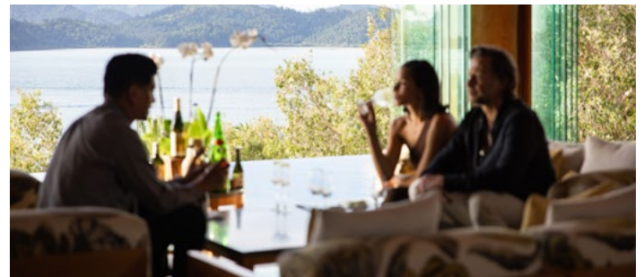
Talk and Taste experience